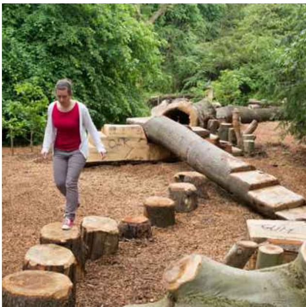
NATURAL PLAY OR SIMILAR APPROVED