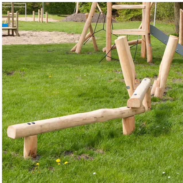
DOUBLE BALANCE BEAM OR SIMILAR APPROVED