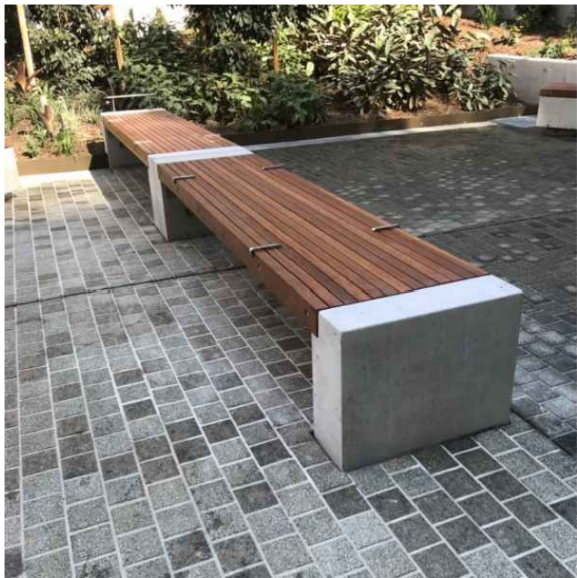
BENCH TO PUBLIC AREAS OR SIMILAR APPROVED