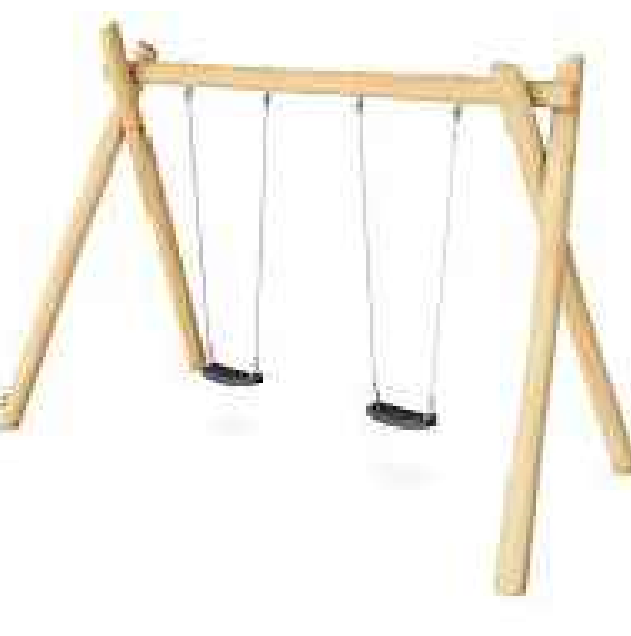
WOODEN DOUBLE SWINGS OR SIMILAR APPROVED