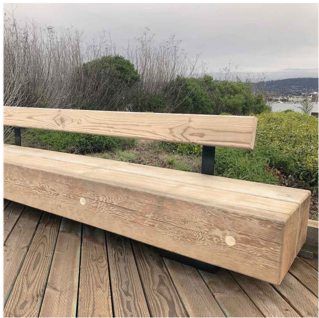
BENCH TO PUBLIC AREAS OR SIMILAR APPROVED