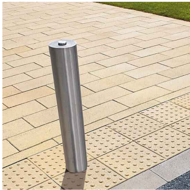
BOLLARDS TO STREETScape OR SIMILAR APPROVED