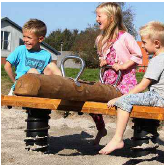
SEA-SAW OR SIMILAR APPROVED