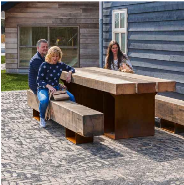
PICNIC TABLES TO PUBLIC AREAS OR SIMILAR APPROVED