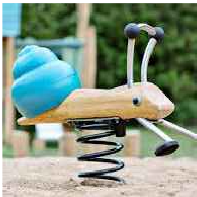
WOODEN SPRING OR SIMILAR APPROVED

NOTE ALL DIMENSIONS TO BE CHECKED ON SITE NO DIMENSIONS TO BE SCALED FROM THIS DRAWING THIS DRAWING IS TO BE READ IN CONJUNCTION WITH RELEVANT CONSULTANT'S DRAWINGS NO PART OF THIS DOCUMENT MAY BE RE-PRODUCED OR TRANSMITTED IN ANY FORM OR STORED IN ANY RETRIEVAL SYSTEM OF ANY NATURE WITHOUT THE WRITTEN PERMISSION OF THE LANDSCAPE ARCHITECT AS COPYRIGHT HOLDER EXCEPT AS AGREED FOR USE ON THE PROJECT FOR WHICH THE DOCUMENT WAS ORIGINALLY ISSUED