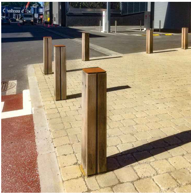
BOLLARDS TO GREEN OPEN SPACES OR SIMILAR APPROVED