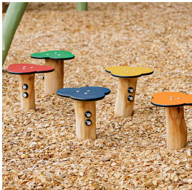
WATERLILIES BALANCE POSTS OR SIMILAR APPROVED