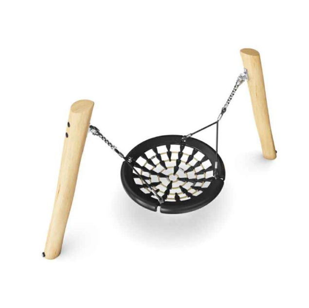
LITTLE SPIDER SWING OR SIMILAR APPROVED