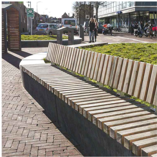
BENCH TO PUBLIC AREAS OR SIMILAR APPROVED