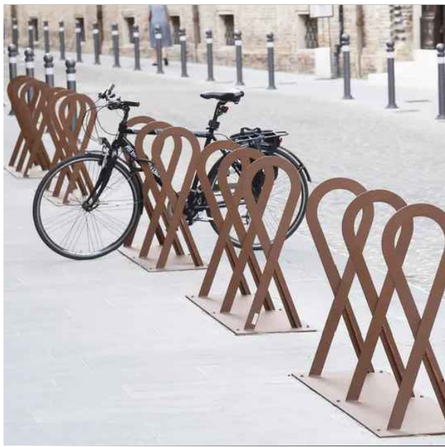
BIKE STANDS OR SIMILAR APPROVED • Root fixed. Foundation to engineer's specification.