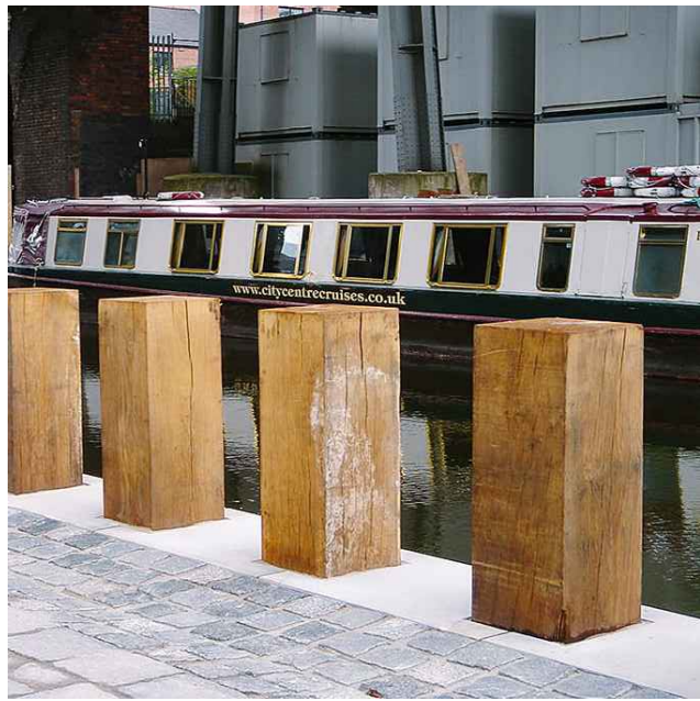
BOLLARDS TO OPEN SPACES OR SIMILAR APPROVED