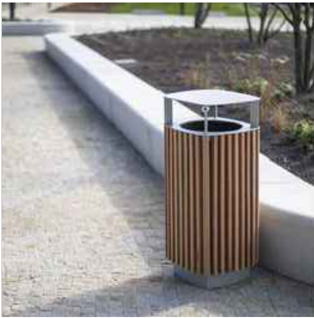
LITTER BIN TO OPEN SPACES OR SIMILAR APPROVED