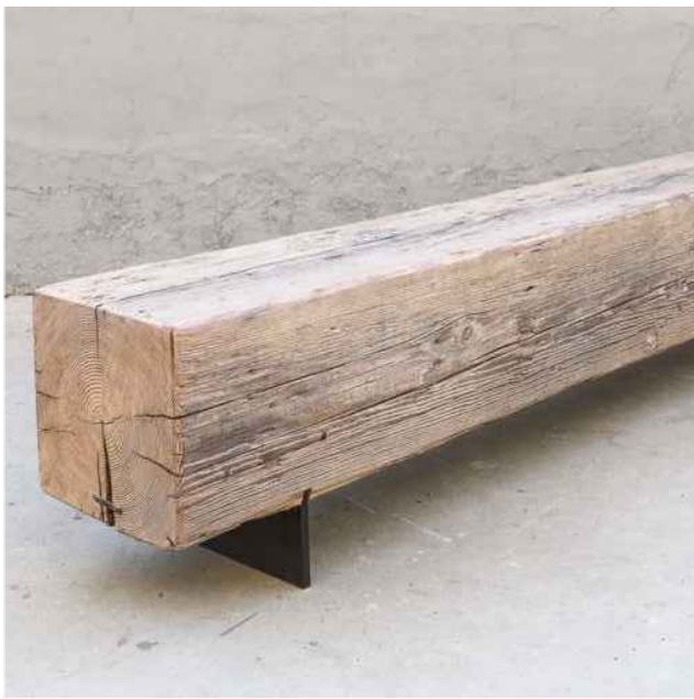
BENCH TO PUBLIC AREAS OR SIMILAR APPROVED