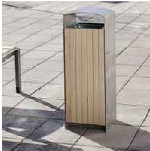
LITTER BIN TO PEDESTRIAN AREAS OR SIMILAR APPROVED